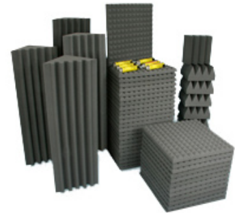
Actual Contents may Vary