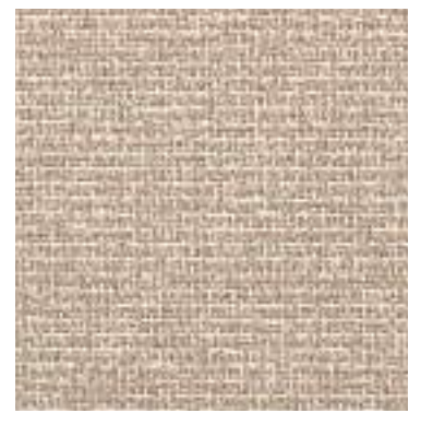
Baxter Beige 7011