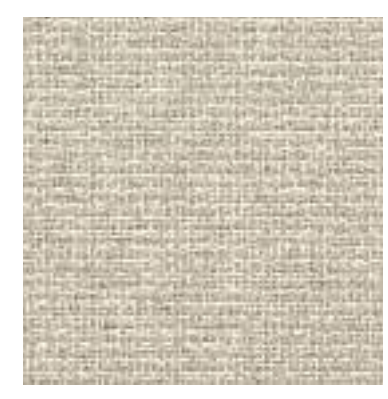
Belmont Silver 7010