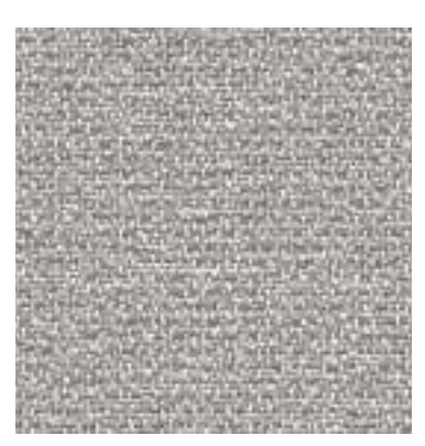
Sherman Pewter 7024