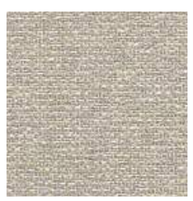
Allagash Mist 7040