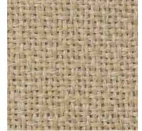
Light Moss 051