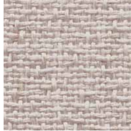
Deer Isle 052