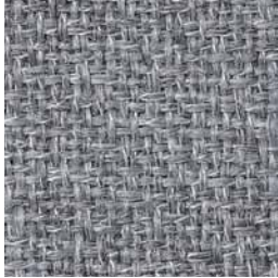
Steels Harbor 055