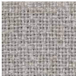
Cement Mix 090