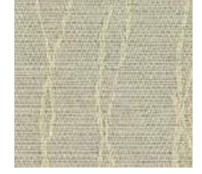
Beach Glass 032