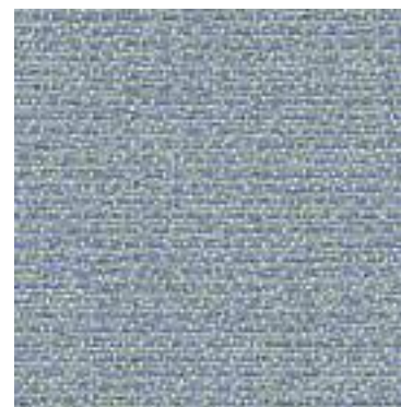
Kennebec Blue 7041