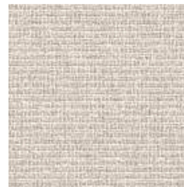
Paris Frost 7020