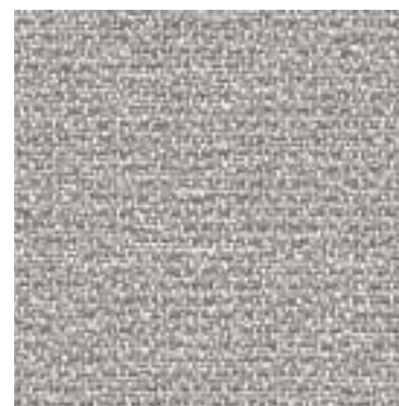
Sherman Pewter 7024