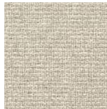
Belmont Silver 7010