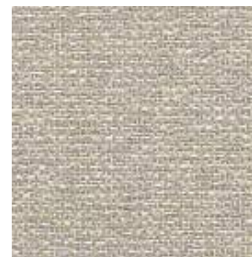
Allagash Mist 7040