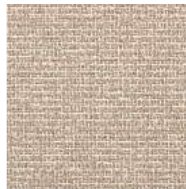
Baxter Beige 7011