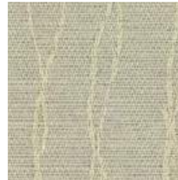
Beach Glass 032