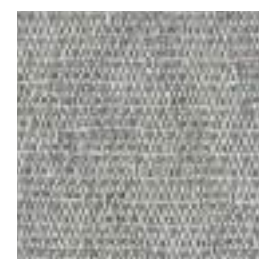
Metallic Taupe 023