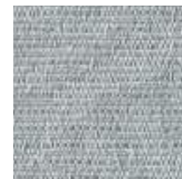
Cloud Blue 022