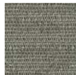
Green Tea 040