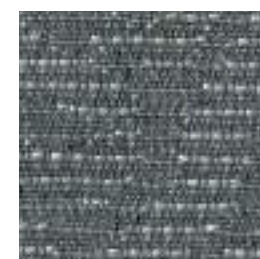
Black Steel 050