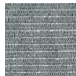
Blue Mist 030