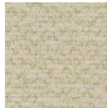
Green Tea 040