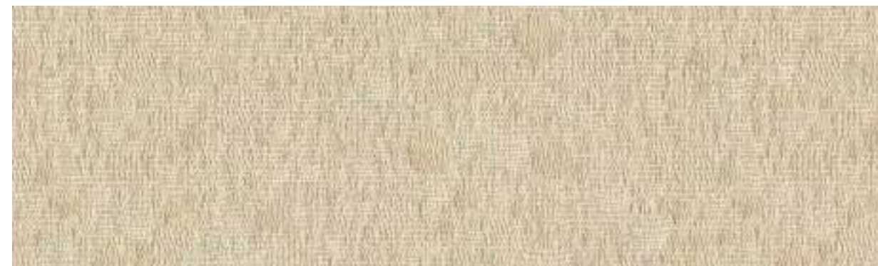
Cream Soda 042