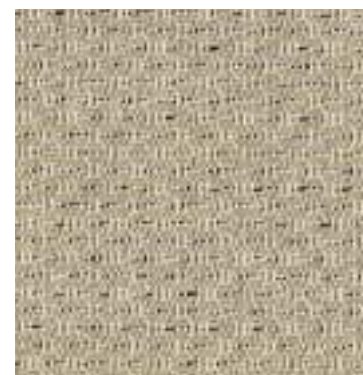
Sand Dune 020