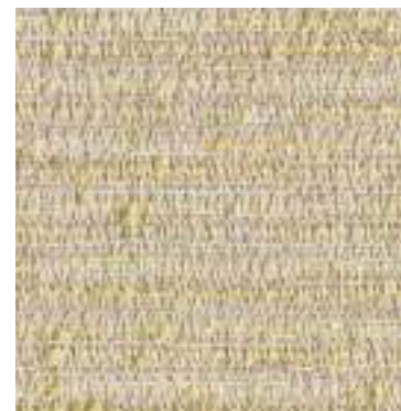
Sun glow 030