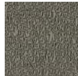
Smoky Quartz 031