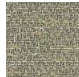
Tiger Eye 030