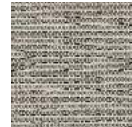
Full Stream 012