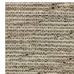
Gold Rush 041