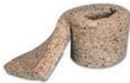
Quiet Batt® Soundproofing Insulation