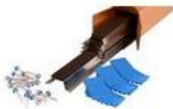
isoTRAX™ Soundproofing System