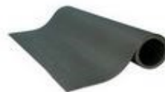
Quiet Barrier® Soundproofing Material