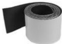
Quiet Barrier® Tape