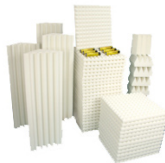
Actual Contents may Vary