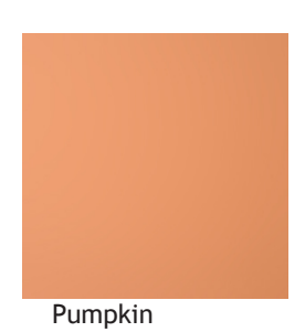
continued on back of page