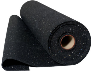
Impact Barrier® Flooring Underlayment QT HD