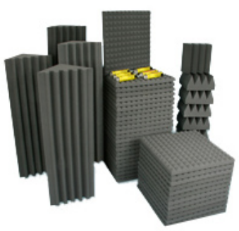
Actual Contents may Vary